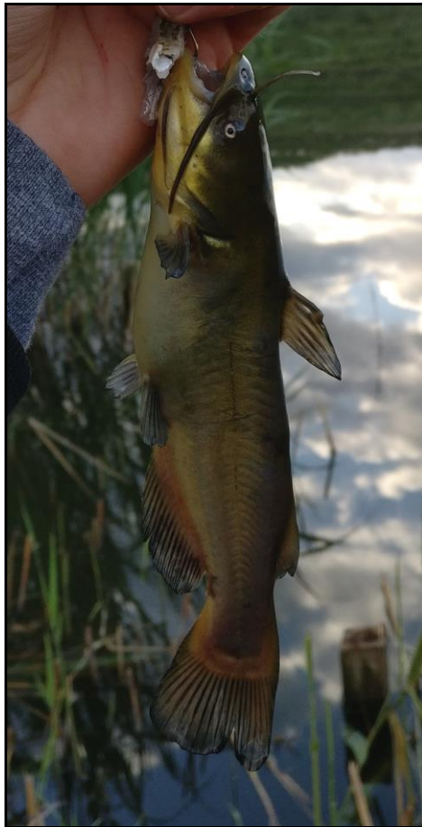
Figure 2. Ameiurus melas captured with deadbait from Țaga Mare lake, Romania.