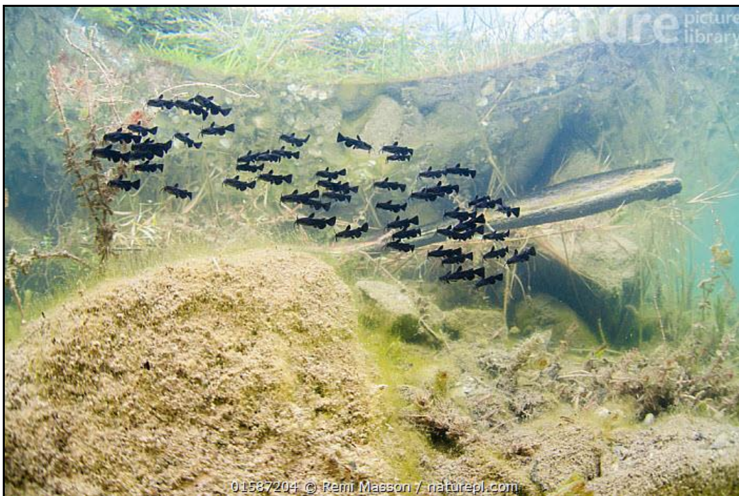
Figure 3. Shoal of Ameiurus melas fry.